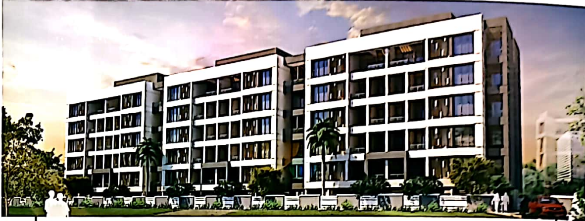
Adora 1 & 2 BHK Apartments