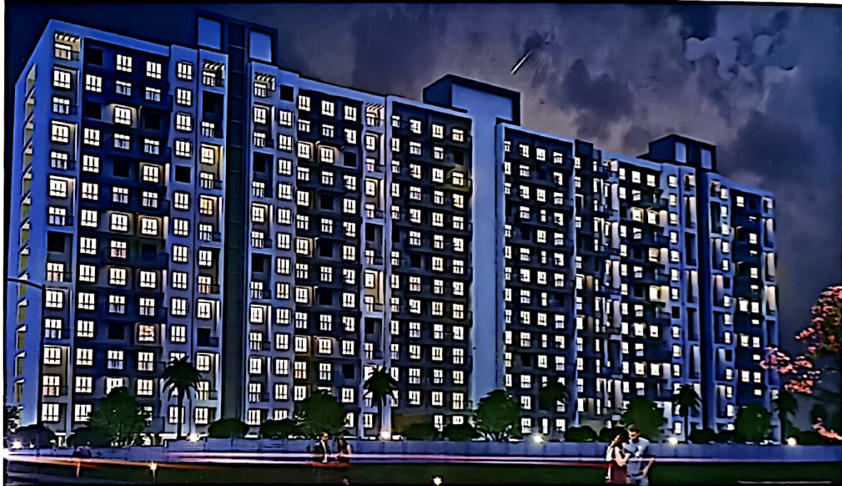
41 Estera 2 & 3 BHK Apartments